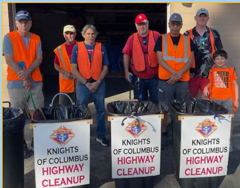
Highway Cleanup October 4