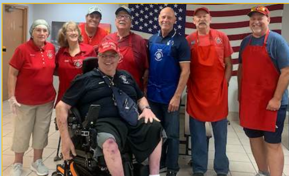
Daily Bread October 27